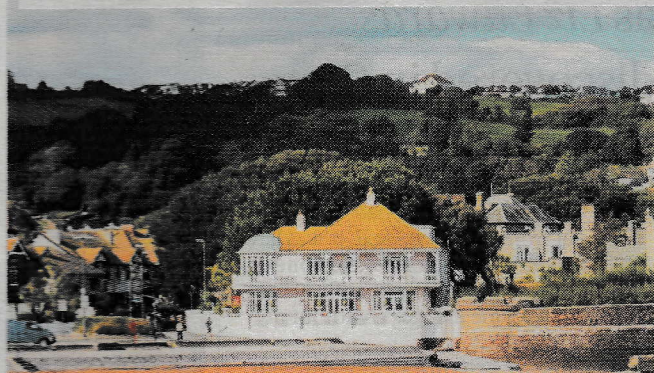
GIVE US A WAVE The beach at Paignton